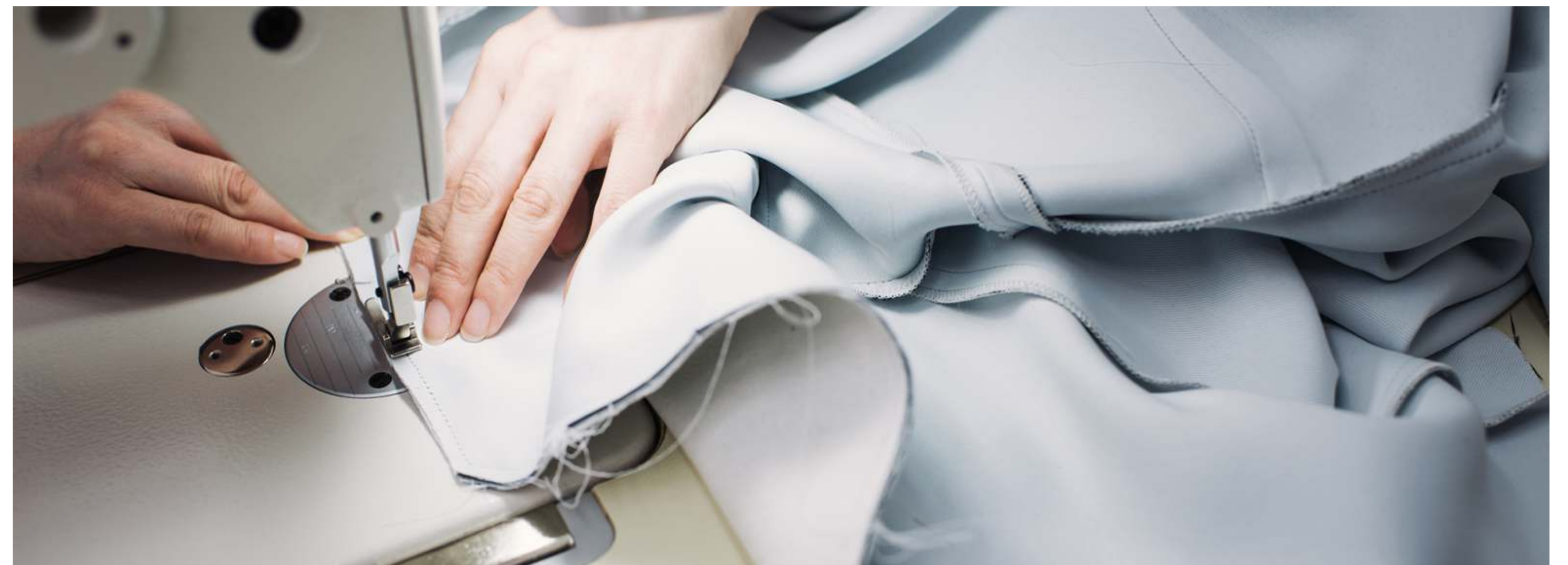
The automation of sewing industry is complex task due to the low bending stiffness of the textile materials